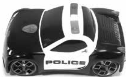
634260M Police Car