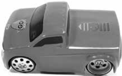
635335M Red Truck

Item no.: 634260M, 635335M, 634383M ADULT BATTERY INSTALLATION REQUIRED