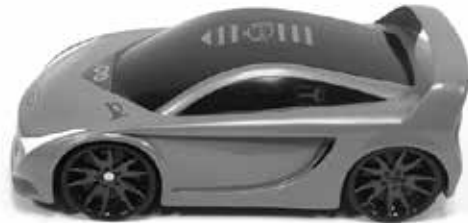
634383M Green Sportscar